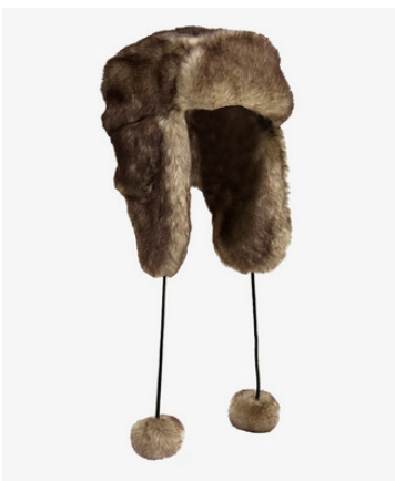
Faux Fur Trapper Hat $12.80 @Forever21