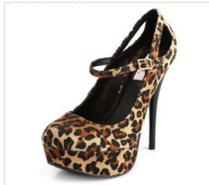
Charlotte Russe Mary Jane leopard print pumps. (Charlotte Russe, $38)