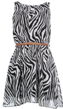
Black Zebra Print Belted Chiffon Dress $24 (£15) - desireclothing.co.uk