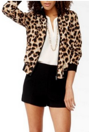
Animal Print Bomber Jacket $24 Forever21.com