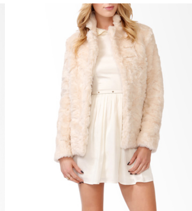
Faux Fur Open Jacket Cream Color Was: $52.80 Now: $36.96 @Forever21