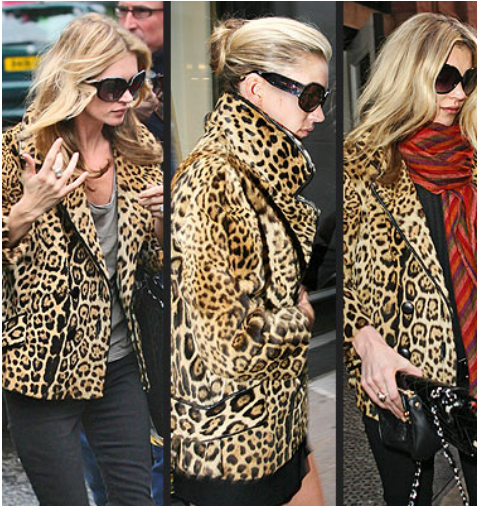
Kate Moss in a leather trimmed leopard print jacket

While animal prints have been around for a couple of years now, the coup d'etat is to find your own unique piece. The trend is to get some color: yellows, blues, turquoises, reds or violets. Of course, black is always chic.