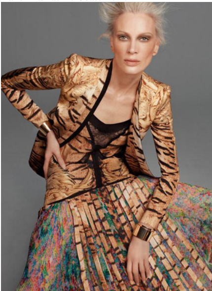
Nothing says expensive and artistic like a Roberto Cavalli design.