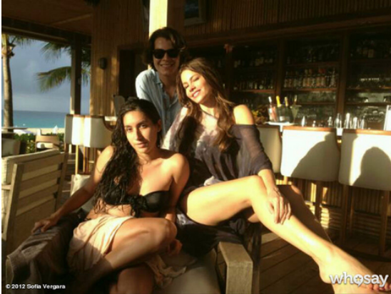
http://www.youtube.com/watch?feature=player_embedded&v=plK8h8kXGxU Sofia's recent vacation on the island of Anguilla