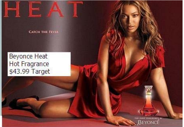
Beyonce Heat Hot Fragrance $43.99 Target