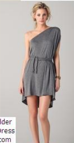
Gray One-Shoulder Riller & Fount Dress $115 shopbop.com