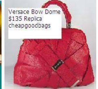
Versace Bow Dome $135 Replica cheapgoodbags