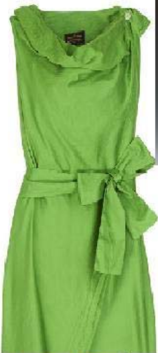
Vivienne Westwood Cotton Sleeveless Wrapdress theOutnet.com