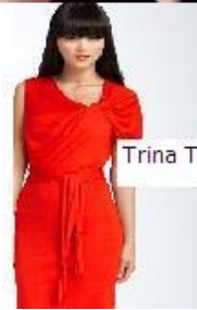
Trina Turk Dress