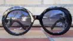
a-Elaina Sunglasses $15 in Black shopsueyboutique.com