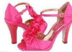
Watermelon Pink Shoes $123.93 Zappos