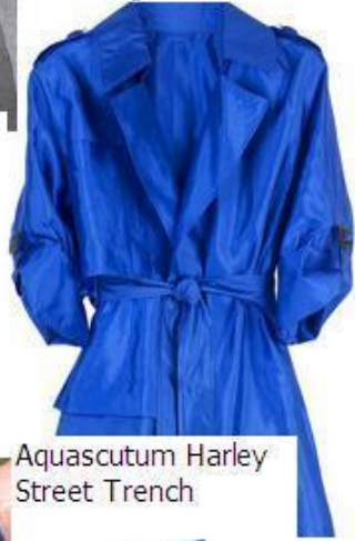
Aquascutum Harley Street Trench