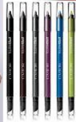
CoverGirl Liquiline Blast Eyeliner