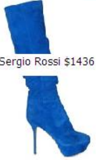
Sergio Rossi $1436