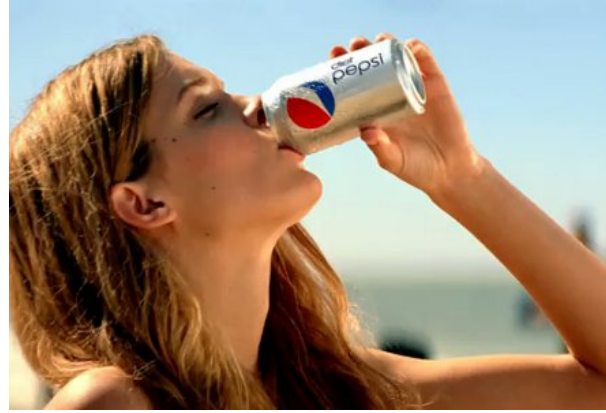
http://www.youtube.com/watch?v=BznOT28yrH4 Watch this short 31 second clip of Sofia's first Pepsi commercial