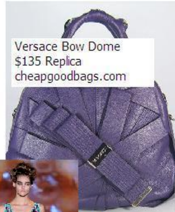
Versace Bow Dome $135 Replica cheapgoodbags.com