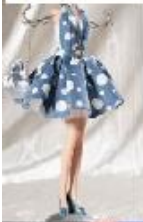
Mannequin Jewelry Holder $35.95 Amazon