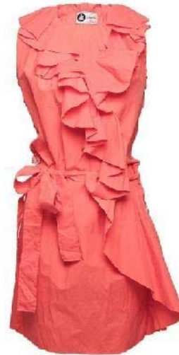
Lanvin Cotton Poplin Sleeveless Ruffle Wrapdress $995 Kirna Zabete