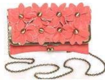
Cosette Floret Clutch $31 Lulus.com