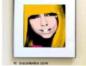
Lady Gaga Framed Pop Art $65 +shipping Ebay