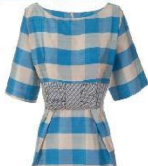
Peter Jensen knee-length $310 FarFetch