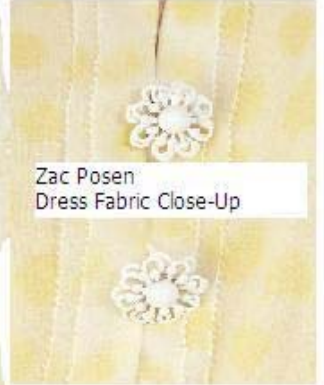
Zac Posen Dress Fabric Close-Up