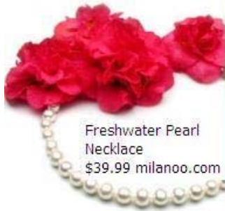
Freshwater Pearl Necklace $39.99 milanoo.com