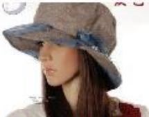
Grey Sun Hat $5.95 wholesale-dress.net