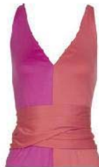
Emilio Pucci Block-Color Sleeveless 100% Silk Full-Length Gown $1,106 OutNet.com