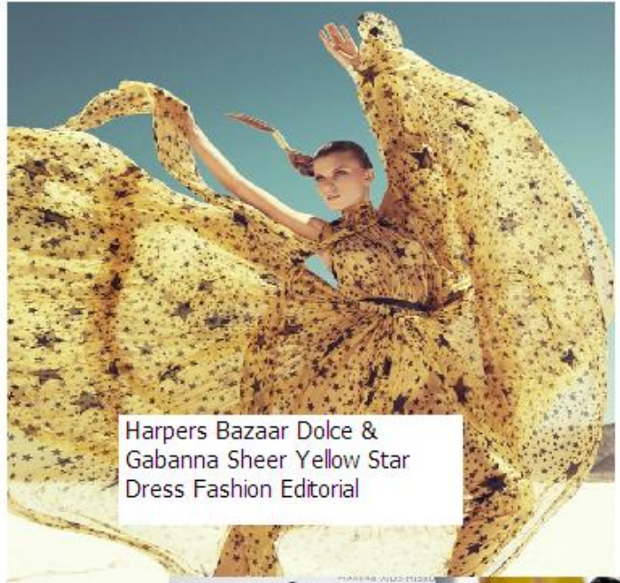
Harpers Bazaar Dolce & Gabanna Sheer Yellow Star Dress Fashion Editorial