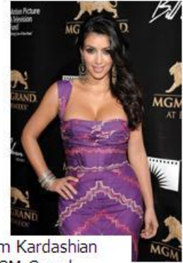
Kim Kardashian MGM Grand at Foxwoods