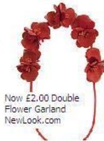
Now £2.00 Double Flower Garland NewLook.com