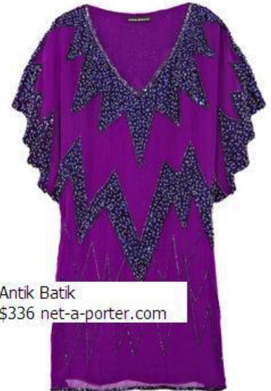
Antik Batik $336 net-a-porter.com