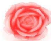
Zad Extreme Rose Ring in Six Colors $10 Lulus.com