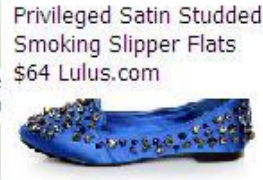
Privileged Satin Studded Smoking Slipper Flats $64 Lulus.com