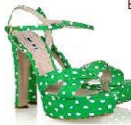
Miu Miu Polka Dot Satin Twill Sandals