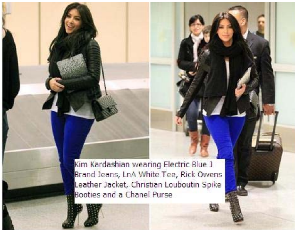
Kim Kardashian wearing Electric Blue J Brand Jeans, LnA White Tee, Rick Owens Leather Jacket, Christian Louboutin Spike Booties and a Chanel Purse