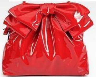
Valentino Bow Dome $1,295 thestylecure.com