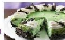
ChocolateGrasshopperCheesecake with fudge mint cookies and creme de menthe liqueur