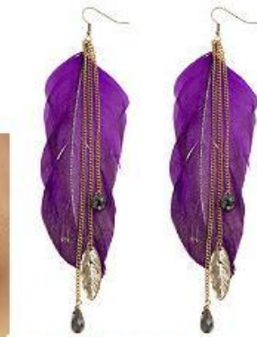
£3.99 Purple Feather Chain Drop Earrings newlook.com