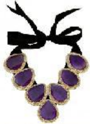
Amethyst Large Statement Beaded Bib Necklace $75 Lily of the East