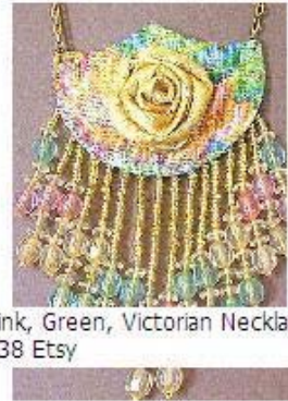
Pink, Green, Victorian Necklace, Rose Necklace $38 Etsy