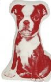
Faunna Terrier Pillow $28 designpublic.com