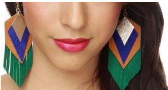
Claire Fong Forest Nymph Camel and Green Earrings $36 Lulus