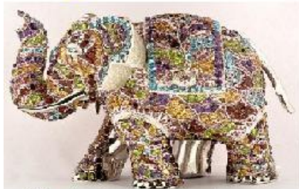
Silver Handicrafts Amethyst Topaz Elephant Ebay rajrangus $5,313.95