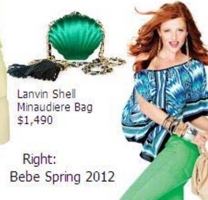
Lanvin Shell Minaudiere Bag $1,490