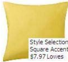
Style Selections Yellow Square Accent Pillow Cover $7.97 Lowes