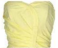
Alice + Olivia Silk-Crepe Bustier Asymmetric Mini