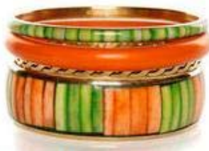
Natural Wonder Orange and Green Bangle Set $18 lulus.com