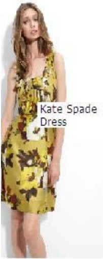
Kate Spade Dress