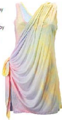
Rainbow-Ray Sleeveless Jersey Vest Dress by French Connection