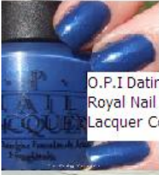
O.P.I Dating a Royal Nail Lacquer Color