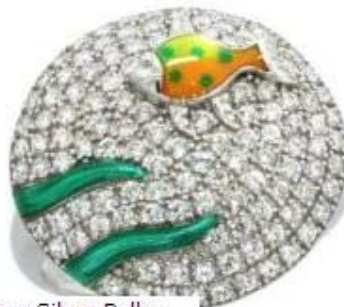
Sterling Silver Polka Dot Fish and Seaweed Ring Amazon $63.91