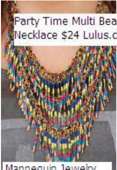
Party Time Multi Beade Necklace $24 Lulus.com