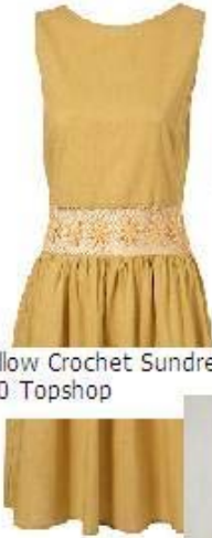
Yellow Crochet Sundress $40 Topshop