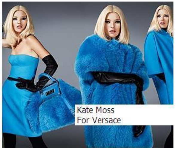
Kate Moss For Versace