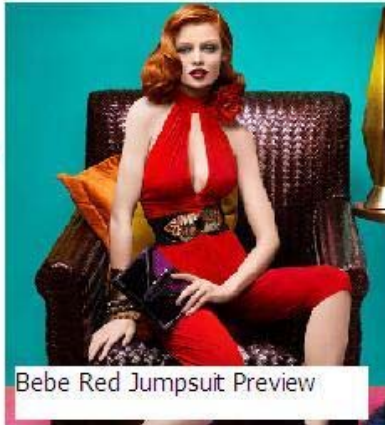
Bebe Red Jumpsuit Preview