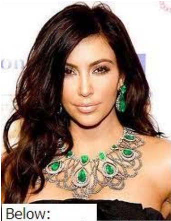
Below: Elegant Green Necklace, Work of Art, Steampunk, Statement Jewelry, Vintage Couture Upcycle, Neo Victorian $167 Etsy