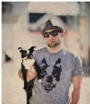
Men's Boston Terrier Grey Graphic Etsy $20