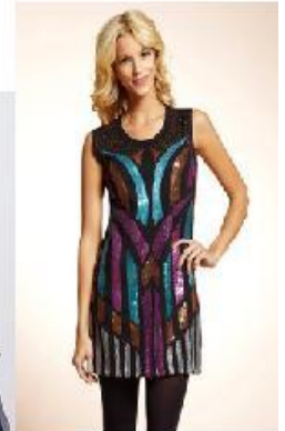
Nicole Miller Dress