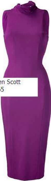
L Wren Scott $2,065