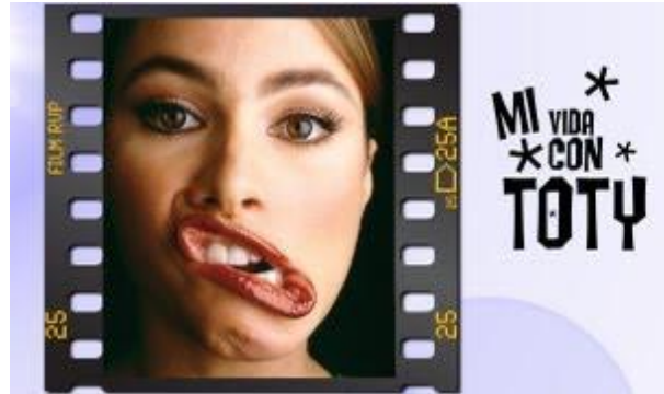
http://www.youtube.com/watch?v=Lt-cYmOGpIw Watch Monolo's video of Sofia's consistently funny side