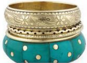
Jasmine's Wish Bangle Set $18 Lulus.com