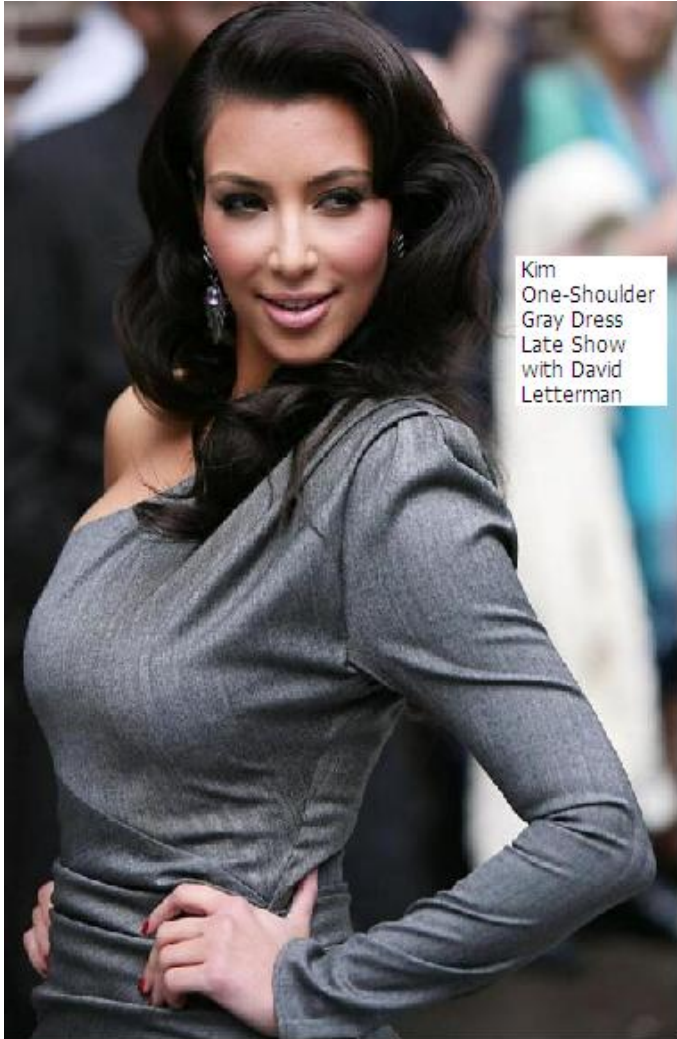
Kim One-Shoulder Gray Dress Late Show with David Letterman