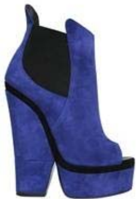
Giuseppe Zanotti $995