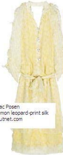
Zac Posen lemon leopard-print silk outnet.com