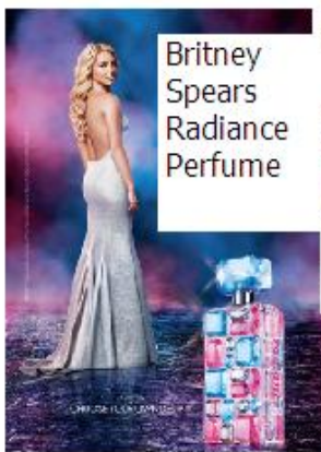
Britney Spears Radiance Perfume