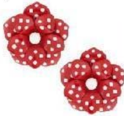
Joan Rivers Flower Earrings $40