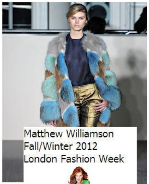
Matthew Williamson Fall/Winter 2012 London Fashion Week