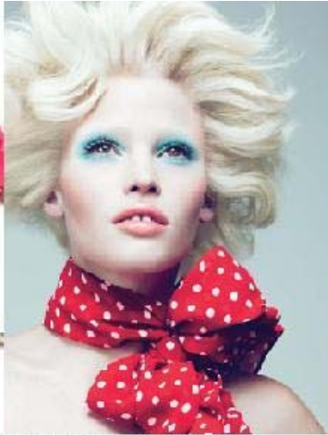
Red Polka Dotted Bow Scarf Lara Stone W Magazine