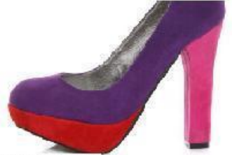
Luichiny Luv Lee Purple Combo Suede Color Block Platform Pumps $65 lulus.com