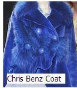
Chris Benz Coat