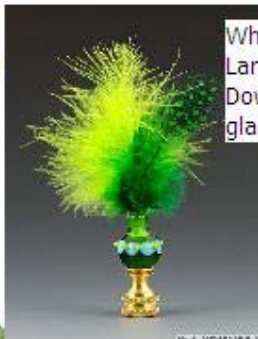
Whimsical Feathered Lamp Finials Downy Urn glasspassions.com