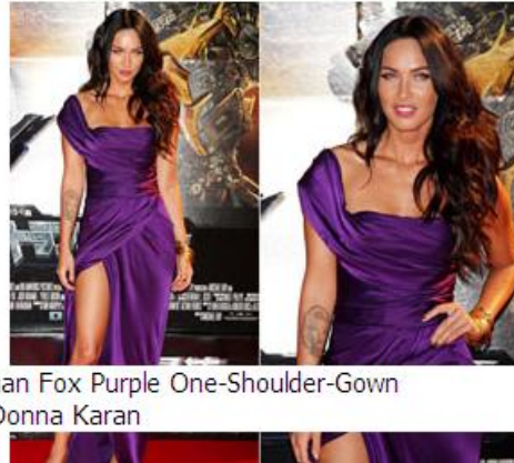
Megan Fox Purple One-Shoulder-Gown by Donna Karan