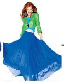
Bebe Spring 2012 Hot Jacket and Skirt

http://www.eyeshadowlipstick.com/130/blue-eyeshadow-make-up-ideas/