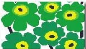
Right: Marimekko Fabric Unikko Emerald Green Large Wall Hanging femaleways.com