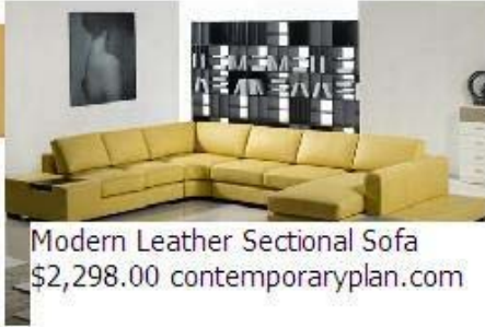
Modern Leather Sectional Sofa $2,298.00 contemporaryplan.com