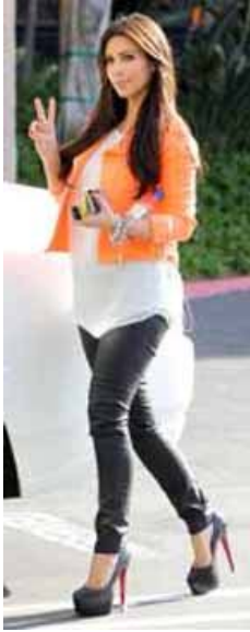
Kim in a cropped jacket