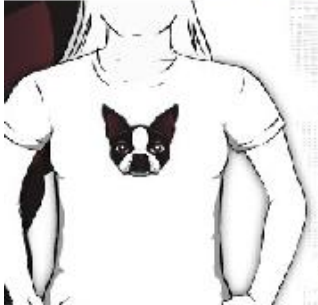
White Terrier Tee Available in Variety of Colors $21.54 redbubble.com