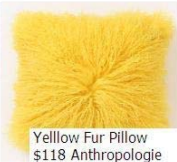
Yellow Fur Pillow $118 Anthropologie