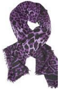
Yves Saint Laurent Scarf $1,202