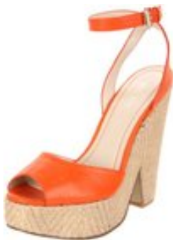
Nine West $68 @amazon.com