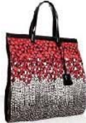
Yves Saint Laurent Canvas Bag $795