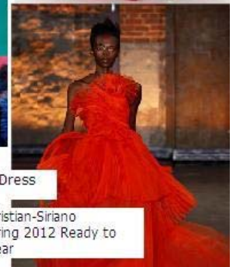
Christian-Siriano Spring 2012 Ready to Wear