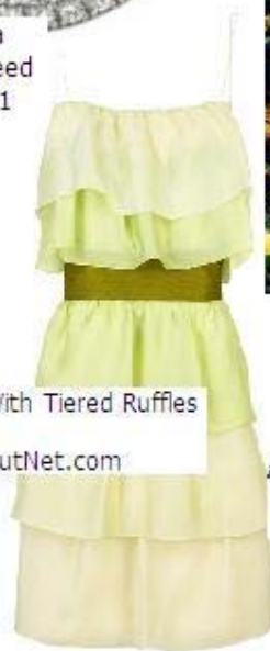
Dégradé Silk With Tiered Ruffles 100% Silk Azzaro $660 OutNet.com