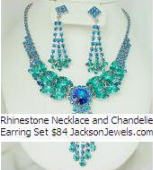
Rhinstone Necklace and Chandelle Earring Set $84 JacksonJewels.com