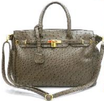
Celest Ostrich Satchel Bag in Taupe $68 shopsueyboutique.com