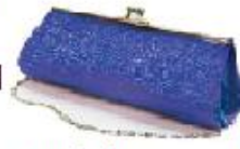
Royal Blue Glitter Twist Lock Clutch $9.99 Luxury Divas Corporation