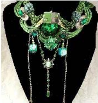
Below: Gold Bridesmaid Necklace Czech Glass Tri Color Necklace - Gift Bridal Wedding $27 Etsy