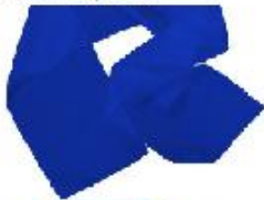
Thai Silks! Habotai Scarf Amazon $4.95