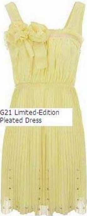
G21 Limited-Edition Pleated Dress