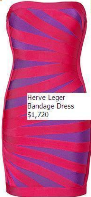
Herve Leger Bandage Dress $1,720