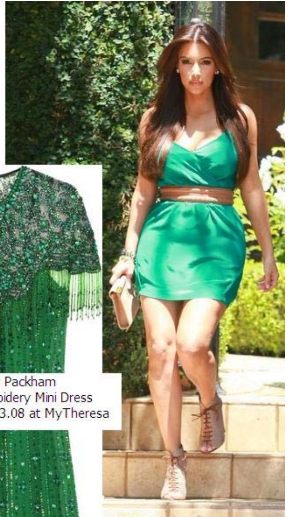
Jenny Packham Embroidery Mini Dress $3,793.08 at MyTheresa