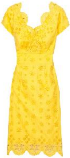
Milly Bright Yellow Cotton Cap Sleeve Dress with Eyelet Embroidery