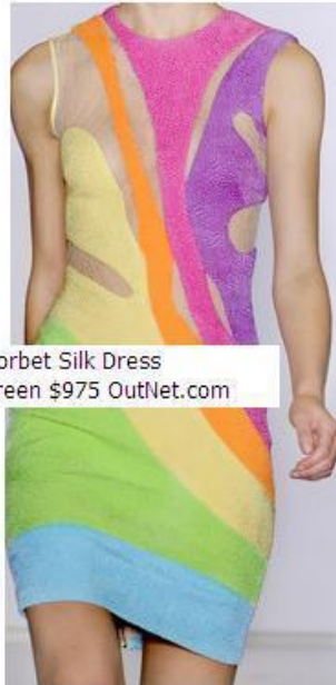
Sorbet Silk Dress Preen $975 OutNet.com