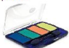
CoverGirl Eye Enhancers 4 Kit Shadow Tropical Fashion 205