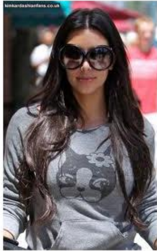
Smokey Grey Get the Celebrity Look: